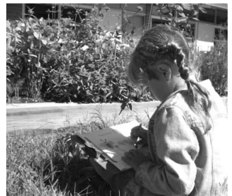
Budding young artist sketches in Mile Creek School's Eldridge Butterfly Garden