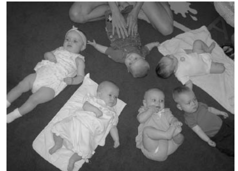
Babies are everywhere at LYSB Parent Resource programs